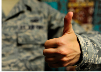
Thumbs-up may be an insult

The caution in using gestures extends to those which may be widespread in a culture, and which we may interpret as universal. The North American A-OK sign (circled thumb and pointer finger, with the other fingers spread out) is an obscene gesture in many European cultures. Likewise, the inverted peace sign – two fingers