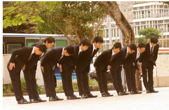
The bow is common in Japan as a greeting and is used in other contexts, such as apologies

There are a number of human interactions which occur largely without the use of language or in which language plays a clearly secondary role. That's the case in rituals, a clearly defined set of actions performed on particular occasions and having symbolic significance. Greetings and departures, for example, have rituals that are largely nonverbal, such as shaking hands or waving. These tend to vary across cultures. In Japan, for example, it's common to bow when greeting someone, with the nature of the bow (how deep and how long) being determined by the nature of the occasion and social connection of the persons involved. In some cultures, kissing on the cheek is the usual greeting, although how many times the kisses are exchanged and which sexes are included can vary. In other parts of the world there may be hugs and kisses, depending on the context and relationship. In Arab countries it's common to bow and touch the forehead and chest (the salaam ) when meeting someone. The Wai is used in Thailand and in other Asian cultures, consisting of a bow with the palms pressed together. In other cultures, people rub noses, such as in the hongi , a traditional greeting of the Maori people in New Zealand. Knowledge of such rituals can be helpful in avoiding awkwardness in first encounters.