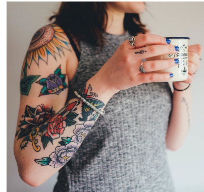
Tattoos have become mainstream in many cultures

Body piercings and tattoos, in bygone days, indicators of low-prestige socio-economic status (sailors, carnival workers), have become mainstream among young people in the US and elsewhere. Older people are likely to retain the images from the past and may have a negative view of heavily tattooed or pierced young people. One of the persistent stereotypes is in regards to women's dress and appearance. Young women in mini skirts and tank tops, especially if blonde, may be perceived as flighty and unintelligent. Muslim women wearing a hijab face prejudice and discrimination in many non-Muslim countries, which is even more pronounced for those wearing a whole body burqa . In some Western countries, wearing traditional Muslim female dress in public or in schools has been banned. In the US, hooded sweatshirts ( hoodies ) are often associated with young black men. In Florida, a young black man, Trayvon Martin, was wearing a hoodie when shot dead by a white "neighborhood watch" member as he was returning from a convenience store. The white man found Martin "suspicious", due to his skin color and attire.