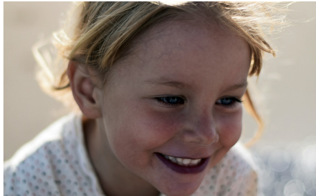
Joy is expressed the same across cultures

plays – tend to be universal, the idea being that expressing basic emotions is an elemental, instinctive behavior common to all humans. This idea goes back to Charles Darwin (1872) who claimed all humans express emotion in the same way. This was later contradicted by anthropologists such as Margaret Mead (1975). It wasn't until the 1960s that so-called "universality studies" were conducted by Paul Ekman and others. In a series of experiments involving participants from a variety of cultures, they showed that there were six universal expressions — anger, disgust, fear, sadness, happiness, and surprise (Ekman, 1972). Later, a seventh ex-