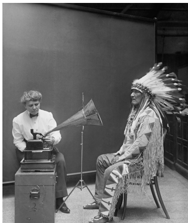
Recording Blackfoot chief Mountain Chief in 1916

Ethnomusicology is the study of music in cultural context. Like intercultural