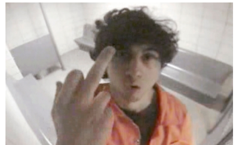
Tsarnaev, from a jail surveillance camera