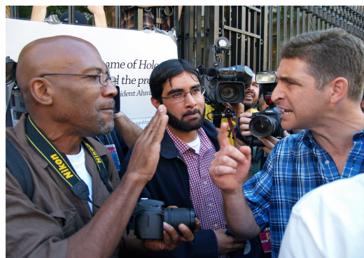
Groups may have different expectations in maintaining eye contact in conversations

Eye contact is often included as a topic within proxemics as it tends to regulate interpersonal distance. Direct eye contact tends to shorten the sense of distance, while an averted gaze increases it. In many cultures, such as in many Asian countries, avoiding eye contact conveys respect. In some situations, making eye contact communicates that one is paying attention. Breaking off eye contact can be a signal of disinterest or even rudeness. Within the US, different ethnic groups have been found to follow different norms in the use of eye contact to regulate conversations. African-Americans maintain eye contact when speaking but avert their gaze