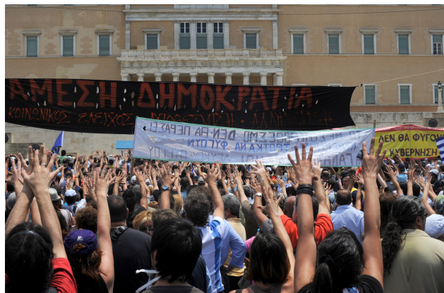
Moutza against the parliament by Greek protesters

One of the richest array of gestures are for communicating insults and obscenities. Insult gestures tend to vary across cultures and are different as well in the extent to which they are used. In Greece, for example, the mountza (μούντζα) or moutza (μούτζα) is a commonly seen insult gesture. It consists of spreading the fingers (one hand or both) and thrusting them outwards, towards the other person (as if flinging something unpleasant). In other cultures, the arm-thrust ( bras d'honneur ) is used, forging a fist and slapping it upwards under the biceps of the arm. Such gestures can be highly offensive and are often considered obscene. Other gestures may convey skepticism or disbelief, such as the French mon oeil (my eye), using a finger to pull down the lower eyelid. The gesture is also used in Japan, known as the Akanbe (あかんべえ).