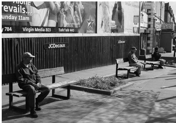
In some cultures, people like to keep their distance

One of the actions which can affect the course of the conversation is for one or the other of the conversants to move closer or further away. Edward Hall (1966)