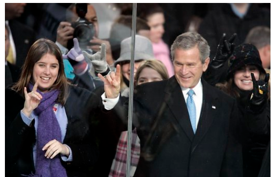
President Bush uses a gesture with a very different meaning in Italy and other countries

known, but it doesn't signal fan enthusiasm or let's rock. It's called il cornuto , indicating that the other person is a cuckold, that is, that his wife is cheating on him (Cotton, 2013). Pointing with the forefinger is a gesture North Americans frequently use. Using that gesture to point at people is in some cultures extremely rude. Likewise, the beckoning gesture with palm turned upward and extending one finger or the whole hand is considered an insult in Japan and other countries. There are a variety of beckoning gestures, In Afghanistan and the Philippines, for example, one motions downward with the palm of the hand facing the ground.