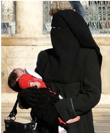
Woman wearing a niqab (veil)

One of the important nonverbal signals all humans send comes through our appearance, i.e. how we dress, arrange our hair, or use body art. Many cultures have rules and conventions for dress and appearance, established through custom