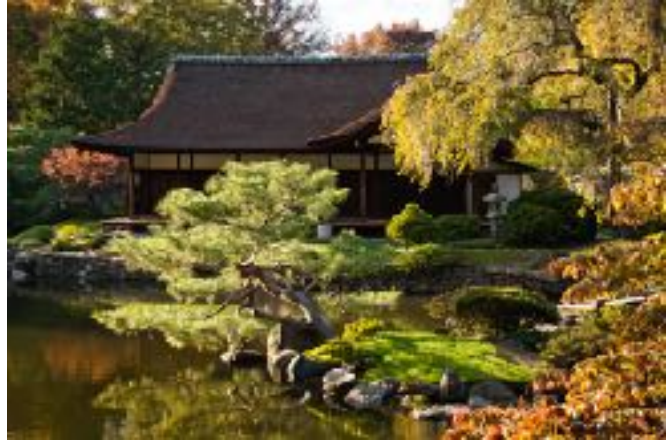
Japanese house in harmony with the surrounding garden

along the outside of the house. One has the impression that the garden and the house flow into one another. The sitting room of a traditional Japanese family home is typically large and can be subdivided using semi-transparent screens called shoji . This allows considerable versatility, with divisions of the rooms easily changed. This modularity carries over to the traditional flooring of Japanese homes. Straw mats called tatami are used for sitting or sleeping. The flexibility in arranging living quarters accommodates the easy sub-division of space to allow for additional members of an extended family. It also enables creation of semi-private space as needed. In that way, it satisfies the need for social space for conversation as well as the possibility of withdrawal into silence and contemplation. Japanese society has changed significantly in recent decades, becoming less homogeneous and less traditional, under Westernizing influences. That has affected housing styles as well. Research has indicated however that the majority of Japanese still favor a traditional style (Ueda, 1998), with elements of traditional design typically incorporated into modern homes and office space whenever possible.