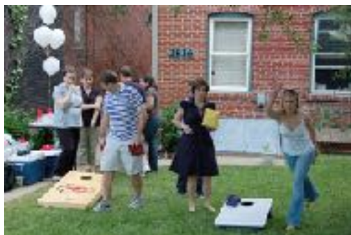
A US backyard featuring games & socializing

In reality, everything in a Japanese garden is carefully planned out to create impressive views and perspectives. In contrast, the US "backyard" is a setting for socialization and sport. Typically, there will be an extensive lawn, well-maintained, allowing room for outdoor activities. This might be used for informal social gatherings, featuring meats cooked on the grill. The overall impression of an American backyard is of an environment created by man, while that of a Japanese garden is a harmonious blend of natural elements. There will clearly be a different dynamic at work in conversations held in an American backyard compared to a Japanese garden. In fact, a Japanese garden is more an invitation to silence (highly valued in that culture) than to conversation.