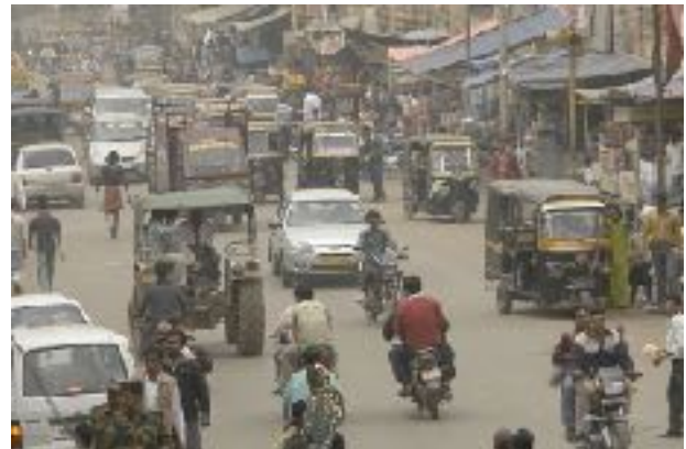
Road traffic in India: functional chaos

When we talk about human living spaces today, one of those difficult to ignore is the automobile. Most of us spend large blocks of time driving or riding in the car. Anyone who has done much traveling outside one's home country has likely been struck by the difference in car cultures, driving behaviors, and traffic patterns. In the US and the UK, for example, drivers generally follow traffic rules and drive in an orderly and predictable way. In other countries, such as Nigeria, traffic regulations are largely ignored. In that country as well as others in Africa cars must compete for space on the road with vehicles of all kinds in addition to pedestrians and street hawkers. In India, cows roam freely over roads, including on the Indian equivalent of major, divided highways.