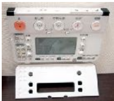
Wireless toilet control panel in Japan

The toilet offers the worker another opportunity for privacy, a valued commodity in a culture that places high value on social harmony, consensus building, and teamwork, all activities calling for contact with others. The toilet itself points to another key aspect of contemporary Japanese culture, the fascination with gadgets and electronics. Many Japanese toilets are high-tech, with a sophisticated control panel allowing for seat warming, massaging, and cleansing sprays. It may also play sounds and music. Soft music may help in relaxation and contemplation, while louder sounds may mask from others the personal activity occurring. That latter feature demonstrates that even in the search for privacy, Japanese tend to take into consideration those around them. Privacy in such a culture is fleeting, and therefore is all the more sought and cherished.