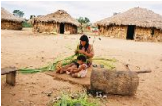
Xavante villagers in Brazil

scholar of intercultural communication recounts his personal experiences of privacy and attitudes towards personal possessions while living in Brazil (see sidebar). Brazil has a great variety of living spaces, with immense differences between life in the Amazonian rain forest and in major metropolitan areas like Rio de Janeiro or São Paulo. One of the indigenous tribes are the Mehinaku Indians. They live in communal villages with no privacy. Their huts house families of ten or twelve people. They have no windows or internal walls, and have doors that open unto an open area that is in constant view. The family members sleep in