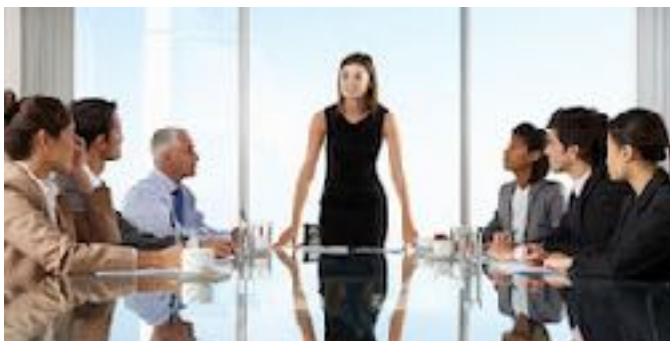
Women in leadership roles is rarely seen in many cultures

An area where divergence is evident is in the role and treatment of women in professional settings. Some cultures, maintain the traditional roles of women as housewives and mothers, with women working predominantly in "nurturing" profes-