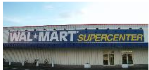
A closed Wal-mart store in Germany

There are many differences between Germany and the US, but they share a number of cultural traits including a strong work ethic, a generally individualistic orientation, a fundamentally egalitarian social and political structure, a monochronic time orientation, and a shared linguistic family (Germanic language group within the Indo-European family). However, it was in fact largely cul-