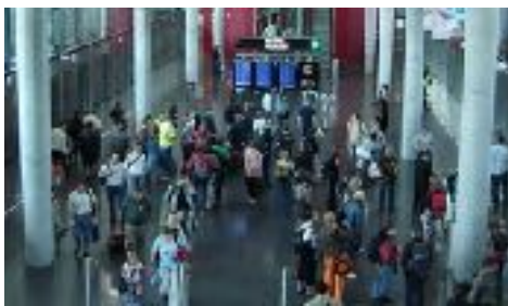
Crowded airport in Zurich, with a high load

The nature of conversations is determined by the conversation partner, the purpose of the encounter, and the context in which it occurs. Germans who went to Wal-Mart were there to buy goods, not to engage in conversations with strangers. Those same Germans may have a quite different attitude towards talking with strangers if they happen to be sitting at the same table with tourists at a local beer garden. How they talk with those tourists will be quite different than a conversation over a beer with friends or co-workers. Where a conversation takes place can have a significant effect in terms of language used. In a beer garden, one may have to speak louder than normal and, because of the mixed clientele, be prepared to speak using a simplified version of one's native tongue or English. The language used will likely be quite different from that at the workplace, more informal, with quite different subjects discussed.