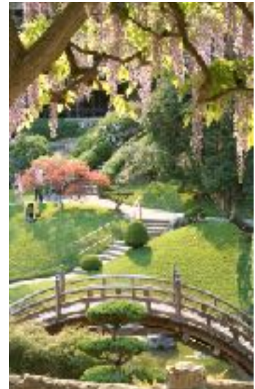
Japanese garden, with a low load

Some cultures purposely create spaces with low information loads for particular purposes or cultural practices. Japanese gardens are intended to facilitate silent contemplation and meditation. They feature carefully designed landscapes with flowing streams, rock formations, meandering walkways, and well-placed benches or other seating. The impression is one of informal natural beauty.