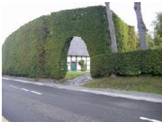
Tall hedge surrounding house in Höfen, Germany

In contrast to the semi-fixed featured space of traditional Japanese homes, houses in Germany tend to favor fixed-featured space in which room divisions are permanent. These distinctions and terms were made by Edward Hall (1966) initially and are often used in descriptions of built environments. Germans tend to divide up space according to its function and to find and maintain an ordered space for all household objects and possessions. Important is that there be