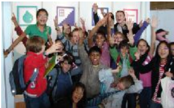
Multicultural school group in Paris

In many countries, schools have become more diverse in their student populations, resulting in the need for intercultural communication competence among teachers and staff. Like business establishments, educational facilities reflect the cultures in which they are located. Prejudices and discrimination all too frequently