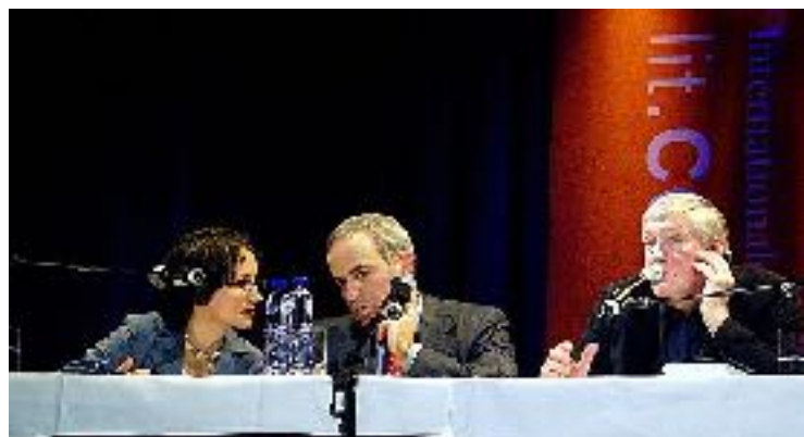
An interpreter for chess player Garry Kasparov using chuchotage

Issues of intercultural communication are likely to be raised in other professional contexts as well. In health care and legal environments, effective communication between parties can be of life or death importance. In both of these areas, translators and interpreters play major roles. Interpreters are concerned with spoken language, translators focus on the written word. While simultaneous interpreting (translated in tandem with the speaker) is used widely in international meetings or conferences, more common in work en-